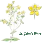
St. John's Wort