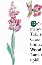
Early Purple Orchid

D Continue ahead to large, many-trunked beech tree. Take right fork to Gangers Hill. Cross with care and follow bridleway ahead past Hanging Wood Farm. At Tandridge Hill Lane turn left and follow path uphill beside road.