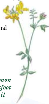
Common Birdsfoot Trefoil

Stroll through chalk grasslands on slopes at South Hawke and below Great Church Wood. They are rich habitats of fine grasses and small flowering plants such as birdsfoot trefoil and twayblade which support butterflies birds and mammals. These have become rare habitats with the loss of traditional sheep grazing and the decline in the rabbit population. Hawthorn and dogwood scrub have invaded and today conservation relies on scrub clearance and the reintroduction of grazing.