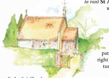
St. Agatha's Church

G Follow path, bearing left around woodland margin and through gate. (A detour to the right to visit St Agatha's Church is well worthwhile). Turn left downhill then bear right at junction. Continue downhill and take narrow footpath on the right. Follow path downhill then turn right over railway tunnel entrance.